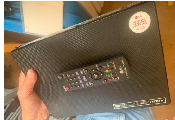
The DVD player and remote control