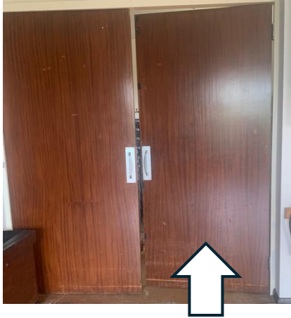
AV Cupboard is behind this door

Get the DVD player, power cord and remote control from the AV cupboard. (You will have been given the code for the keysafe which will contain the front door key and the key to the AV cupboard). Turn the sound cabinet on by flicking the power on above the AV cupboard.